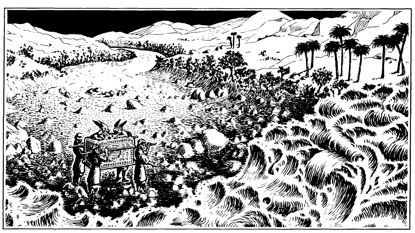
God held back the water of the Jordan River when the priests stepped into the water.

The next morning, Joshua rose early to prepare the army of Israel to march on Jericho. God had given very specific instructions as to what Israel was to do. According to God's instructions, all the mighty men of Israel were to march