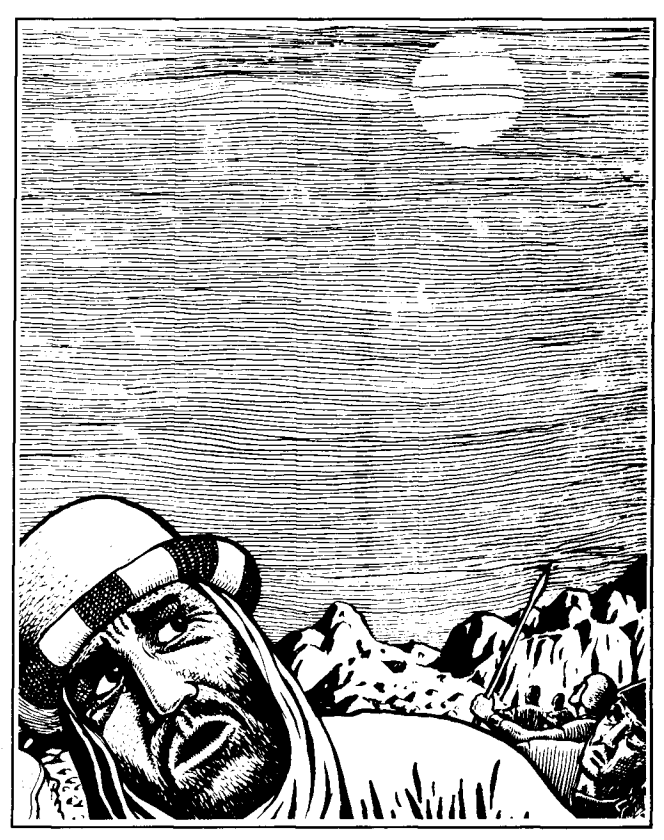
God miraculuosly caused the sun to remain in the same place until all the Canaanites were killed.

Adoni-zedek, king of Jerusalem, heard of the treaty between the Israelites and the four Hivite cities. He wanted to punish the Hivites for this, so he gathered a large army from other cities to attack