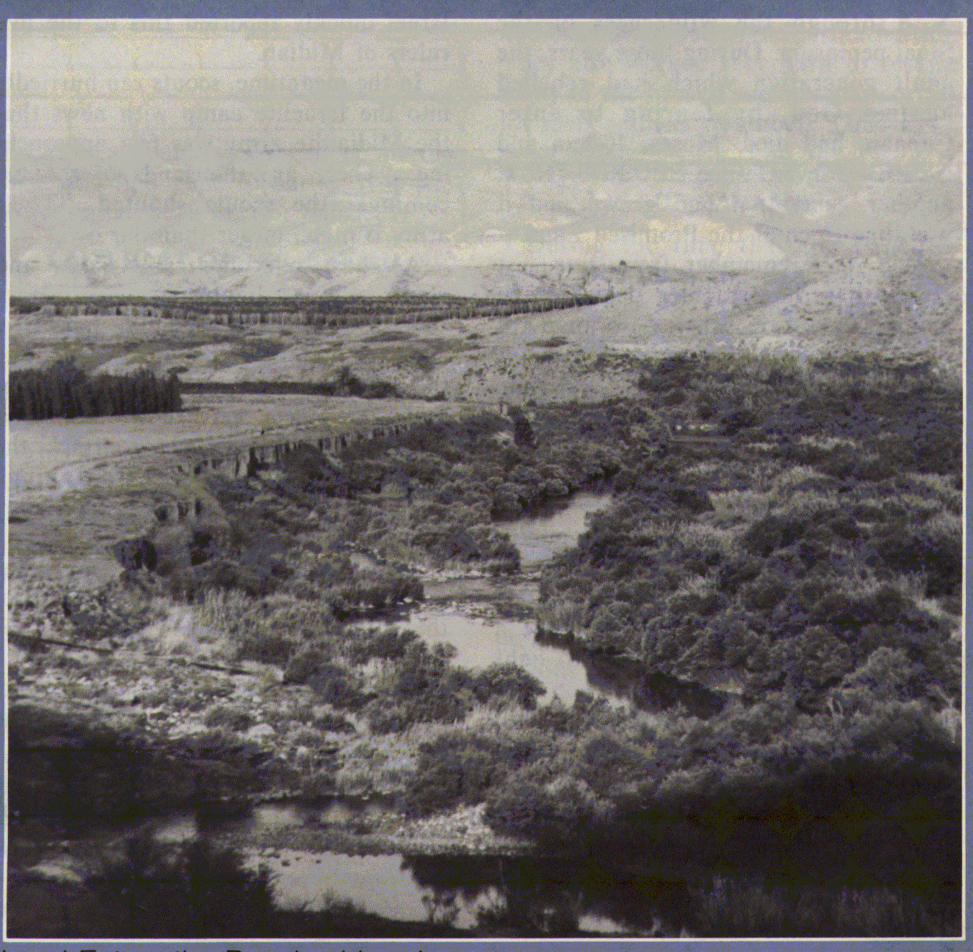
Israel Enters the Promised Land